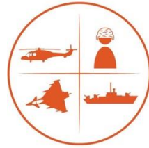
Collective Training Services