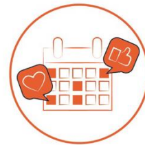
Marketing, Communications and Events