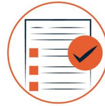
Governance, Risk and Compliance