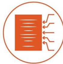
Information and Data Services