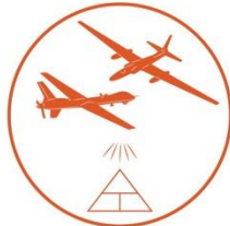
Intelligence, Surveillance, and Reconnaissance (ISR)