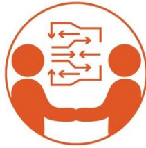
Engineering Delivery Partnership (EDP) and New Technical Markets