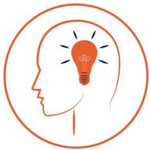
Learning and Development