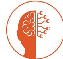
Mission Training Devices